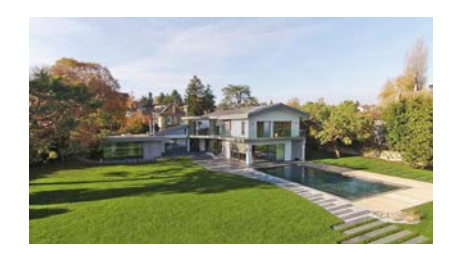
St-Sulpice Asking price CHF 19'000'000