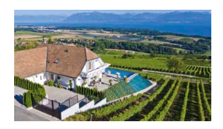
Fechy Asking price CHF 4'700'0000