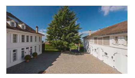
Jouxtens-Mezery Asking price CHF 15'000'000