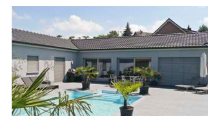
Ursins Asking price CHF 2'450'000