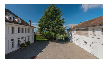
Jouxtens-Mezery Asking price CHF 15'000'000