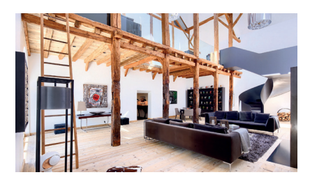
Trelex Asking price CHF 8'750'000